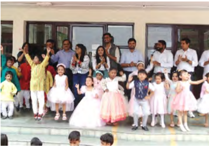
Variety programme by children